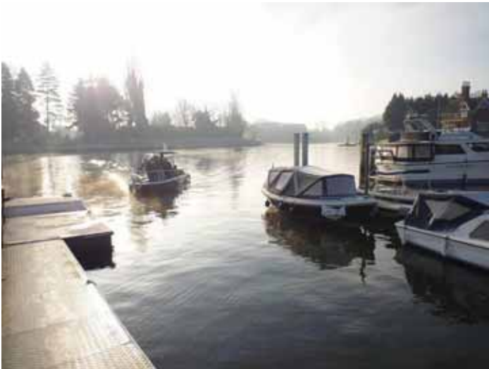
On the way to Chertsey

14 th January 2012 - The walk started from Elmbridge Canoe Club Car Park near Woking taking the riverside path to the ferry and crossing to the north bank. The route followed the path upstream to Chertsey Bridge where we crossed to the opposite bank. We followed the riverside path downstream before heading across the field and through woods to the reach the Wey Navigation with its lock. We continued along the canal before crossing a bridge and taking a path to the "Old Crown" for lunch. In the afternoon we walked down river to and around Desborough Island before returning to the car park.