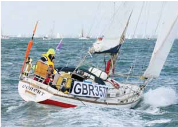
Cohort under full sail in the Solent...