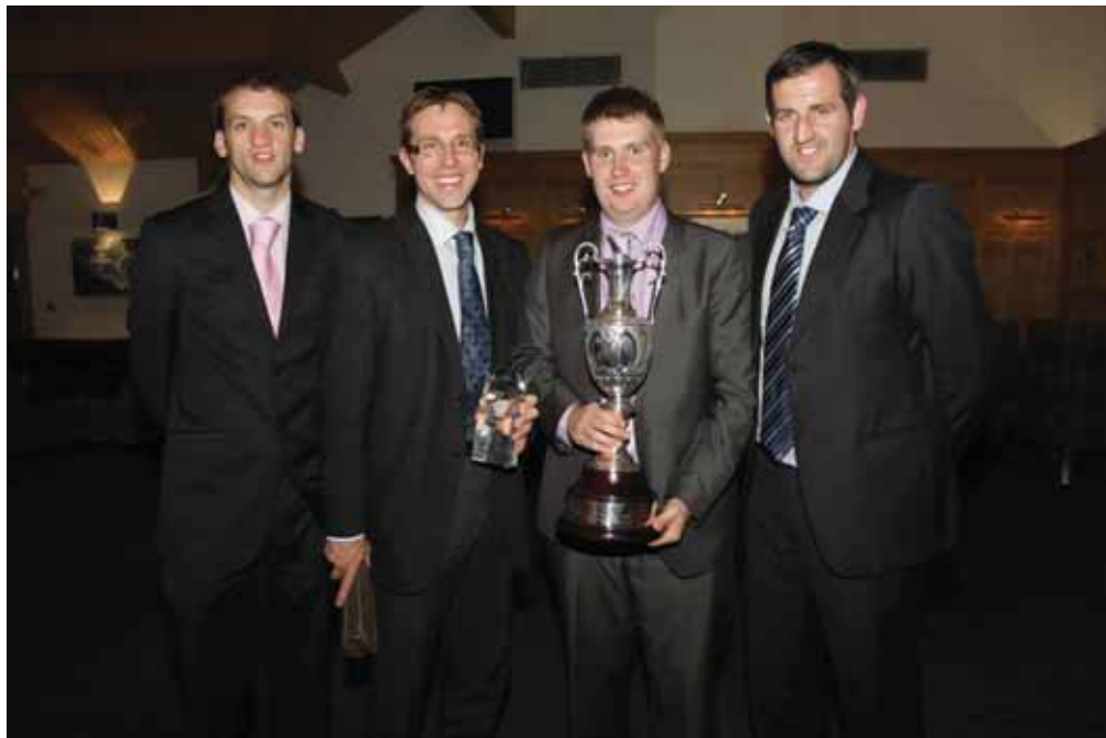
Thomas Telford Trophy Winners - West of Scotland