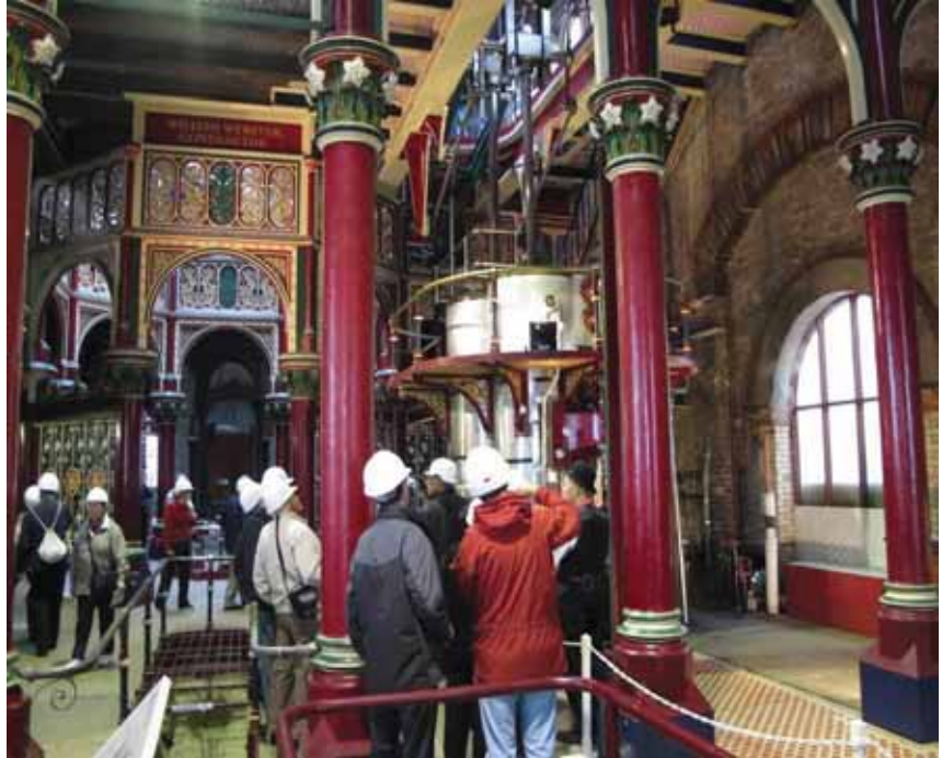
Crossness Pumping Station

24 th November 2012 - The walk started from Richmond Railway Station. We took a footpath via Richmond Green to the road bridge which we crossed to join the riverside path heading downstream. We saw the recently re-opened footbridge at Richmond Lock and followed the Thames Path downstream to Kew Bridge. We passed the well known historic pub The London Apprentice and took the path through Syon Park. At Brentford we crossed the River Brent/Grand Union Canal and followed it to the Thames Lock which controls access to and from the River Thames. The path continued through Watermans Park and passed under Kew Bridge and on to The City Barge where we had an excellent lunch. After lunch we returned to Kew Bridge and crossed to Surrey to take the riverside path back to Richmond, passing the markers for the original longitude meridian en-route.