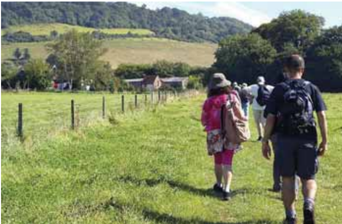
Approaching Lower Box Hill Farm

8 th September 2012 - The walk started from the Dorking Railway Station Car Park. We followed a footpath to the mill where we crossed the River Mole and continued past Lower Box Hill Farm and Boxhurst before ascending the Downs to join the North Downs Way. We quickly reached the viewing point where the Olympic Rings were displayed. After a short break we took a path through the woods along the top of the downs before descending to cross the zig zag road to take a track to the River Mole, which many of us crossed by stepping stones. After lunch at The Stepping Stones in Westhumble we took a path through Norbury Park, Chapel Farm and Denbies Vineyard back to Dorking Station.