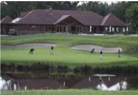
The 18 th green and Clubhouse