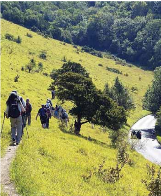
Descending to the zig-zag road