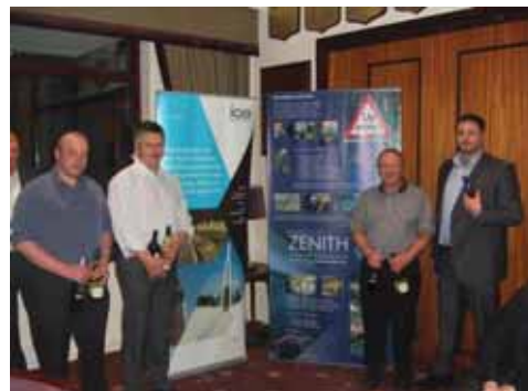
The Winning Birse 2 team