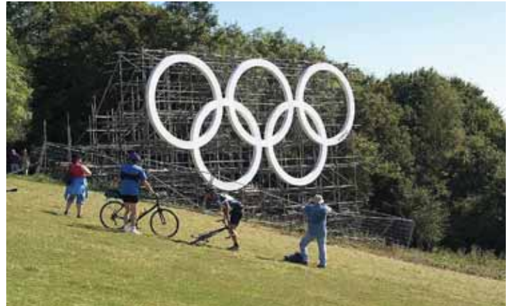
The Olympic Rings