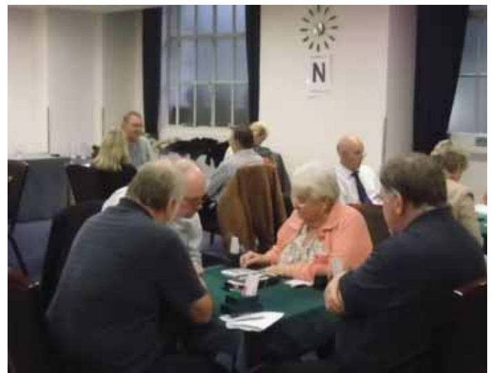
During play in the Palmer Room at ICE